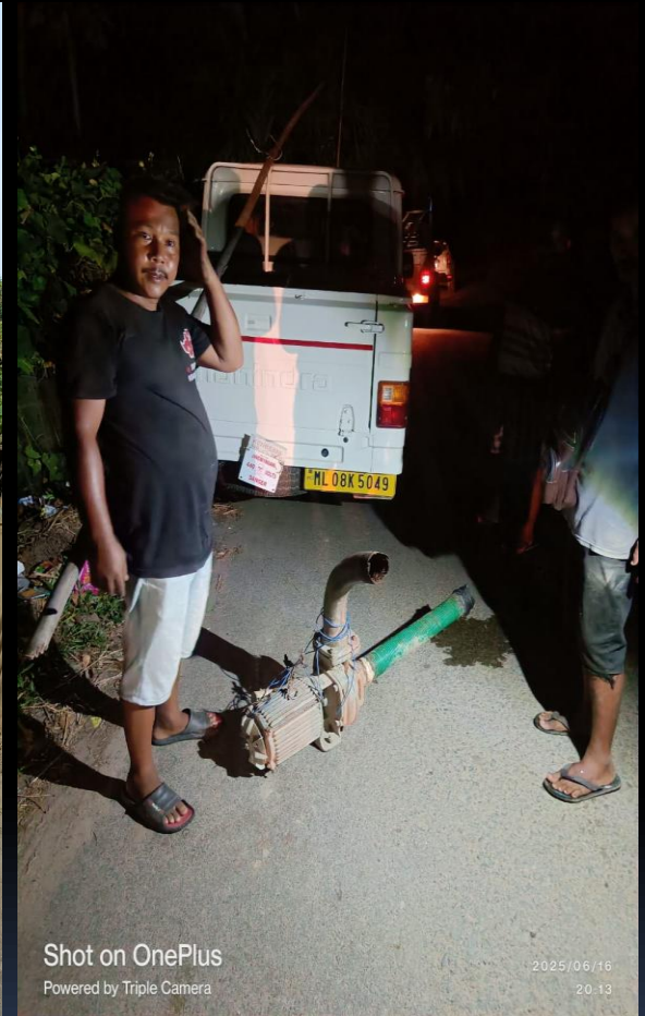
Cha'ue kadegipao,bijolini bosturangko sakkina ra'enga.

Shot on OnePlus Powered by Triple Camera