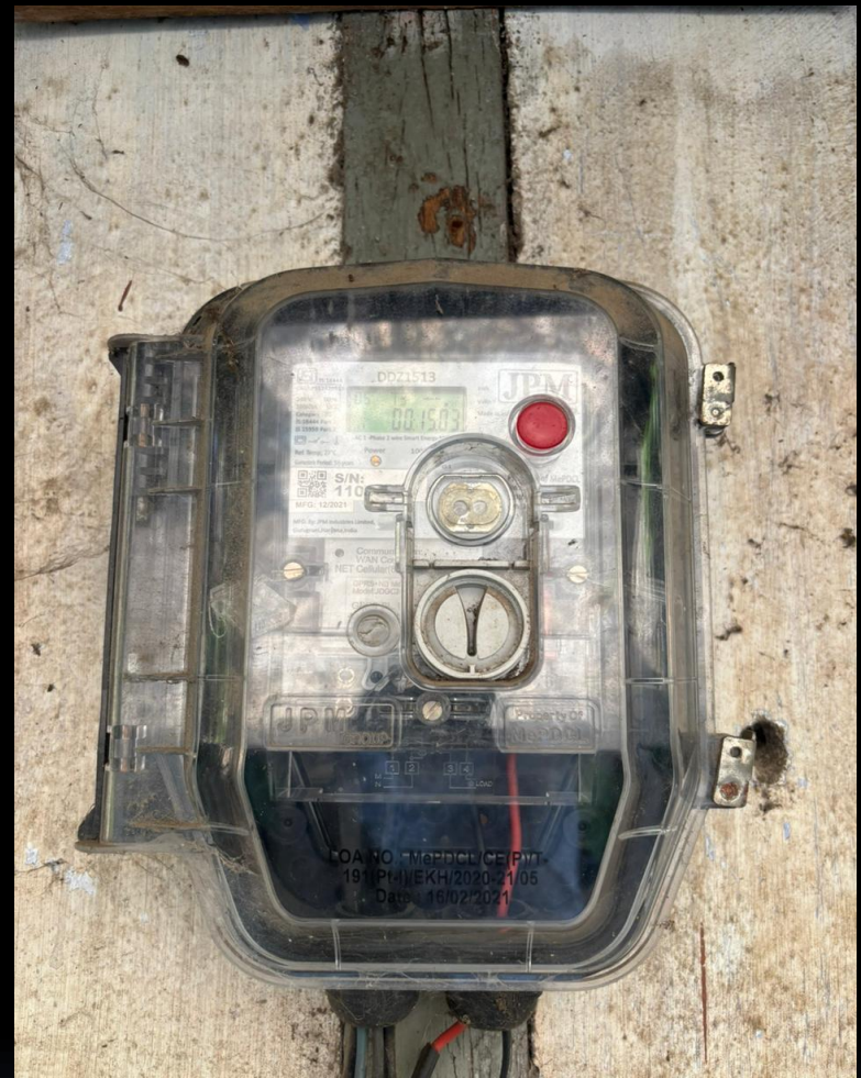
Meter connection tik ong'a.