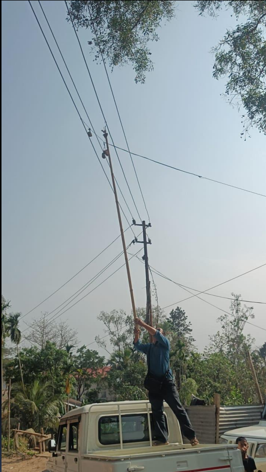
Bijoli cha'ugipako line den'enga.