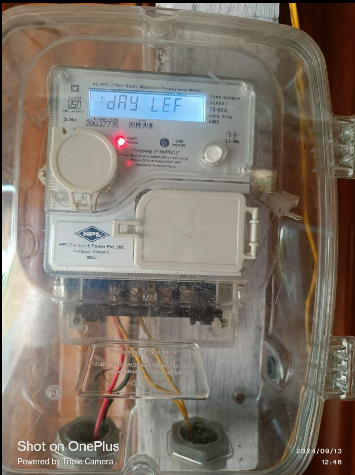
Meter connection tik ong'ja ( kabate ra'a)